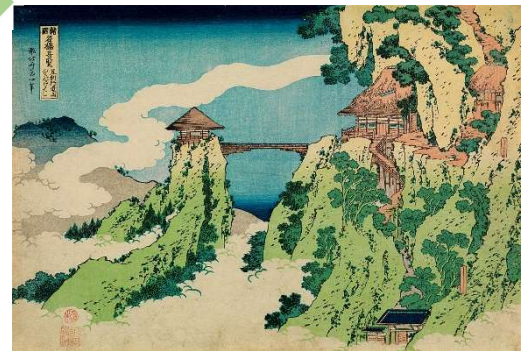
Katsushika Hokusai The Hanging-cloud Bridge at Mount Gyōdō near Ashikaga, from the series Remarkable Views of Bridges in Various Provinces The Sumida Hokusai Museum (2nd term)