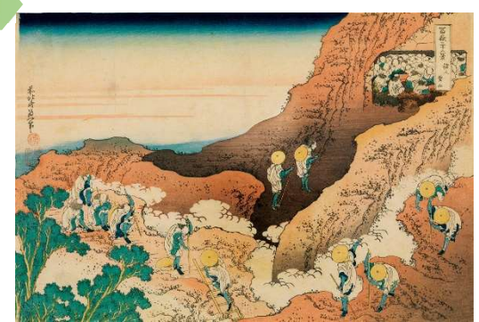
Katsushika Hokusai Pilgrims Climbing in the Mountain, from the series Thirty-six Views of Mount Fuji The Sumida Hokusai Museum (1st term)